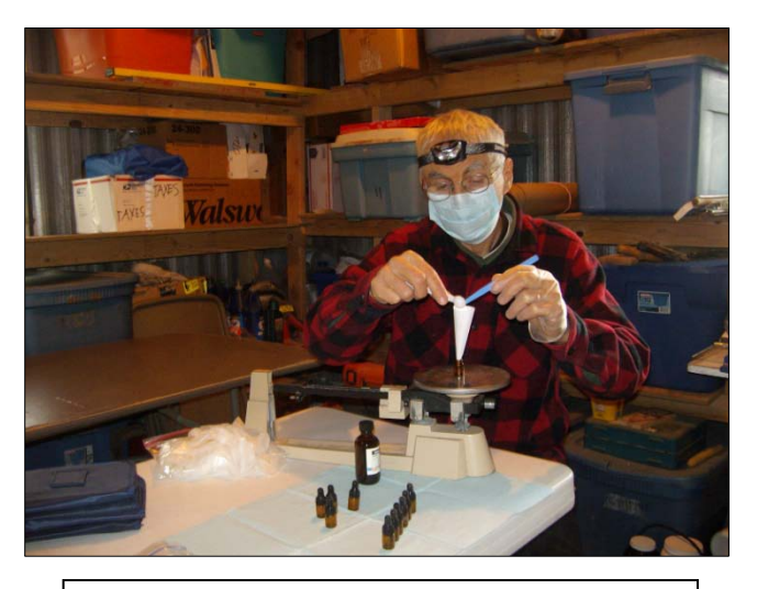
Preparing our silver nitrate solution bottles

Fabricating our light, cheap and portable tray tables.